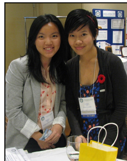
(Above photos) The second BCFPA Students’ Networking Event attracted 57 attendees.